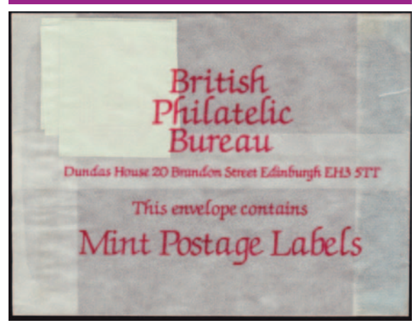
Specially inscribed 'Mint Postage Labels' only on sale for a short period and very few were sold. An interesting addition at only £5.00 £3.50